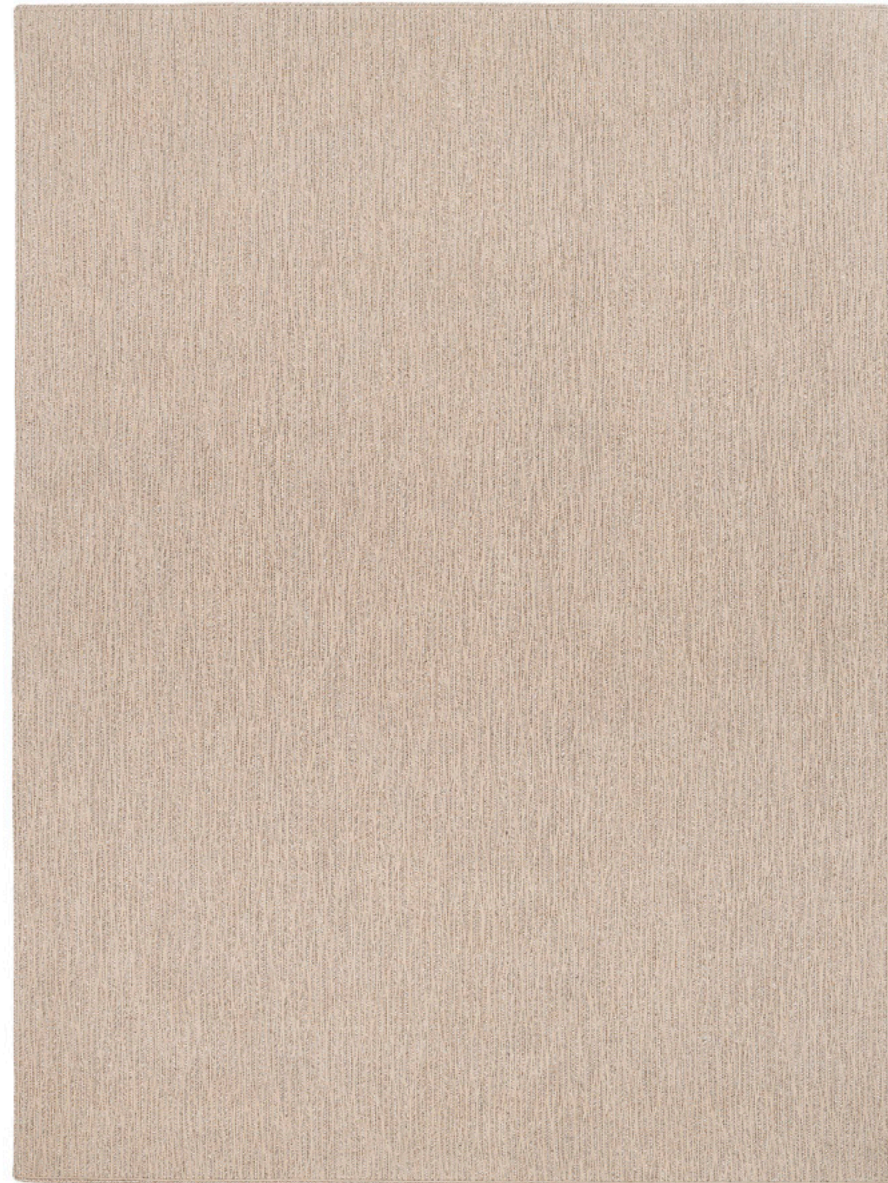
Braid 2 0251