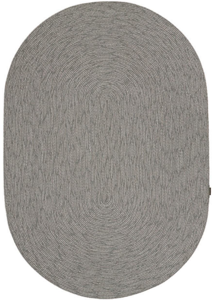
Braid 2 0151